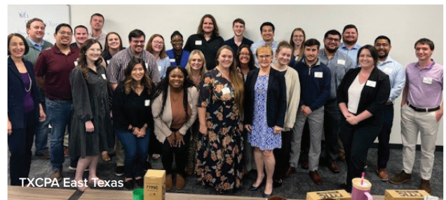
TXCPA East Texas