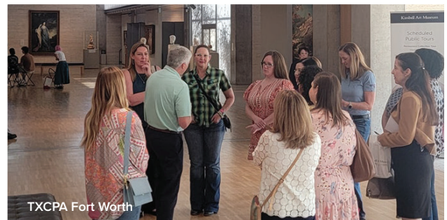
TXCPA Fort Worth