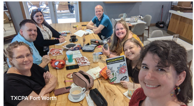
TXCPA Fort Worth