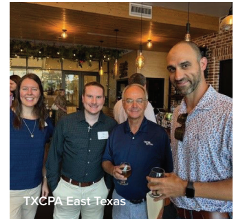
TXCPA East Texas