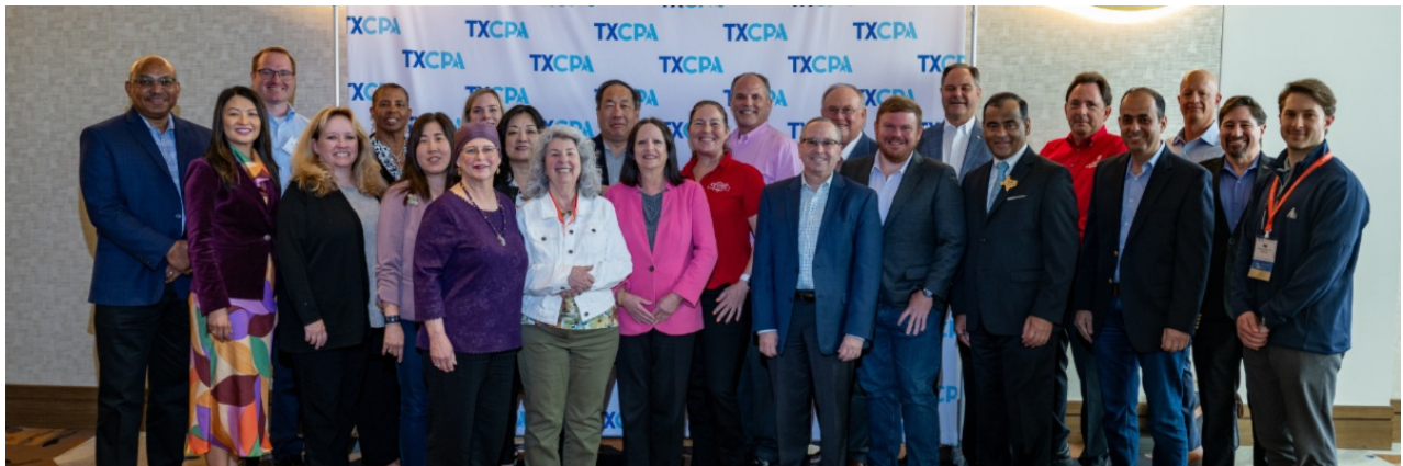
Houston Chapter members attending the TXCPA Annual Membership Meeting and Leadership Council Meeting