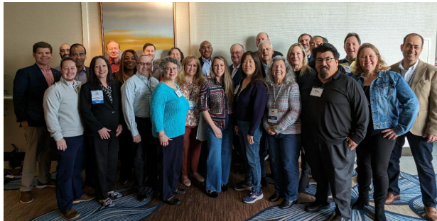
Houston Chapter Leadership Council members at the 2024 TXCPA Midyear Meeting