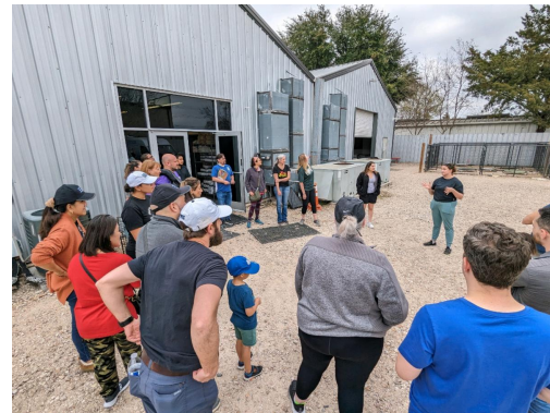
TXCPA HOUSTON Volunteer Day on March 2, 2024 at Rescued Pet Movements

If you'd like to donate to RPM, click on the button to the right.