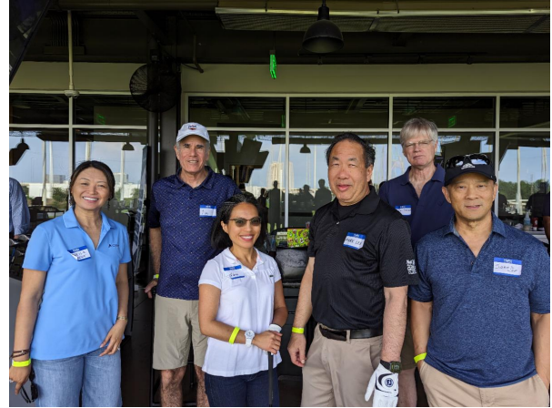
Team "The Lee D"