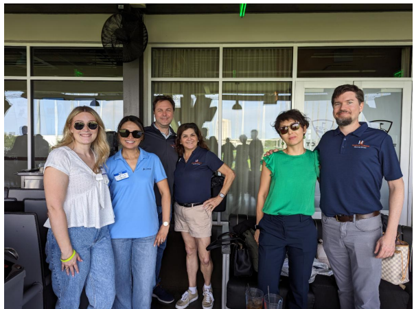
Team "The High Cee's"