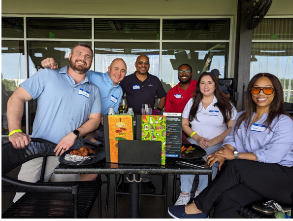
Team "Kicking Assets"